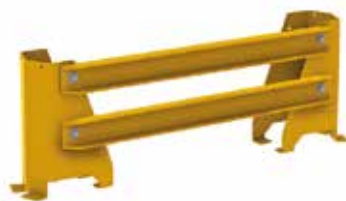
Rack end protectors