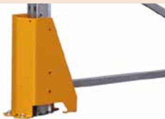
Pallet Racking post protectors

ACCESSORIES ARE AVAILABLE VISIT OUR WEBSITE