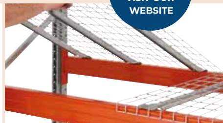
Galvanised wire mesh decks