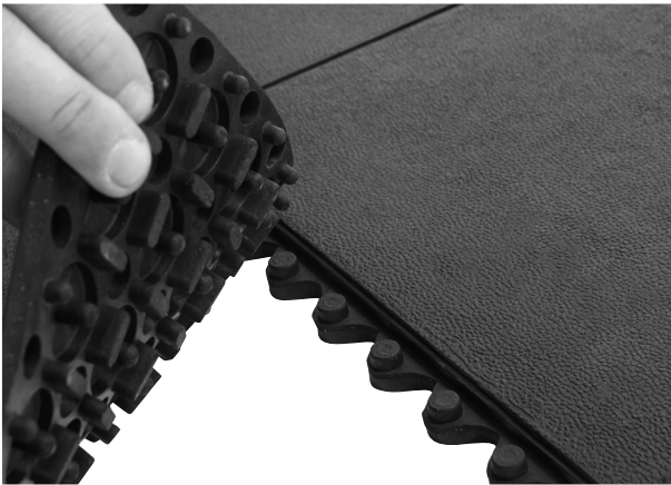
BDSTSM - UNDERSIDE