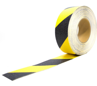
Yellow / Black