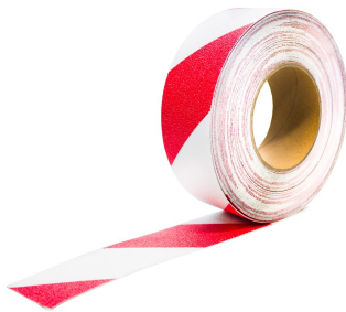
Red / White